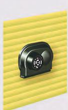
Sidewall direct venting